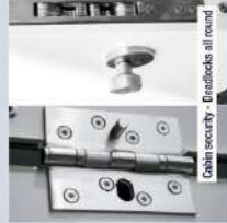
Cabin security - Deadlocks all round