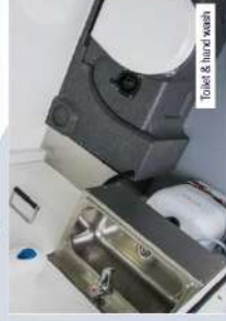
Toilet & hand wash