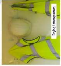
Drying / storage room