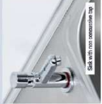
Sink with non-omnesive tap